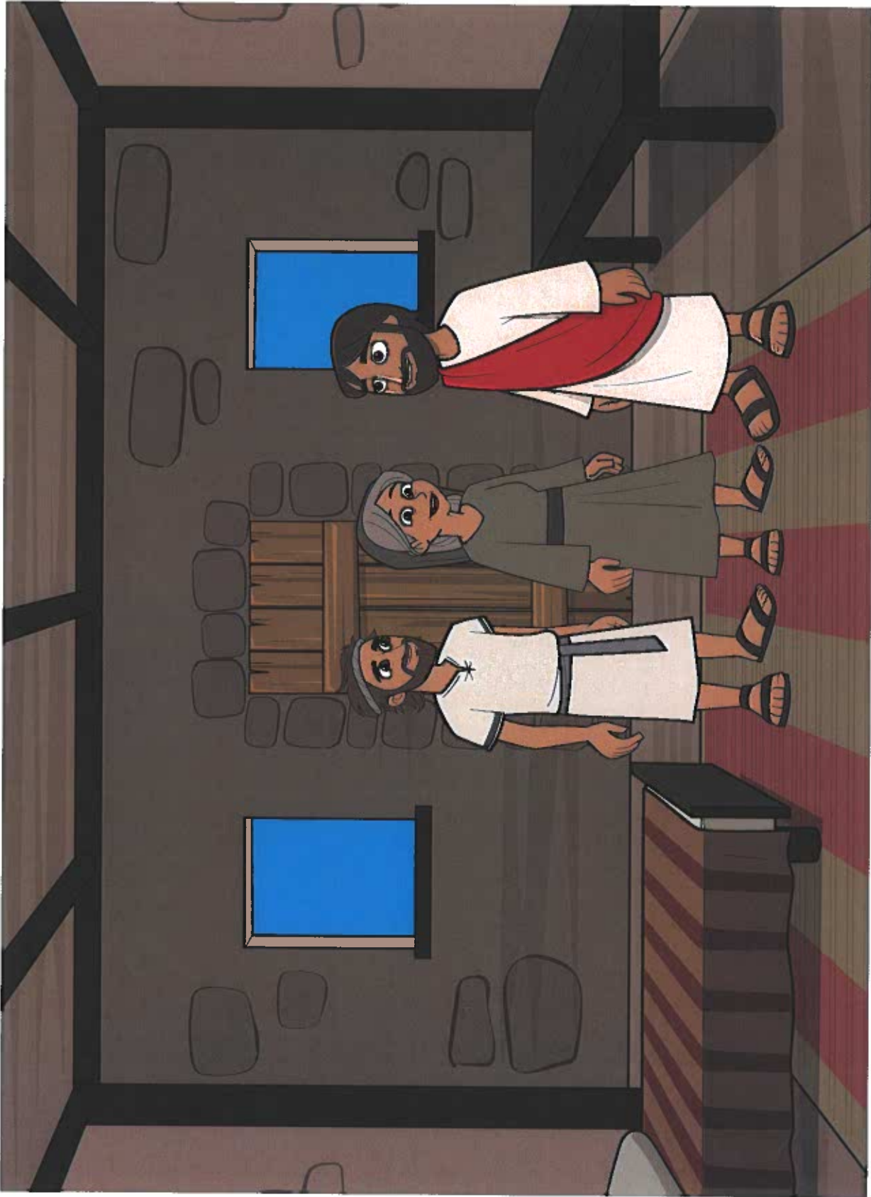
Jesus healed Peter's mother-in-law by touching her hand.