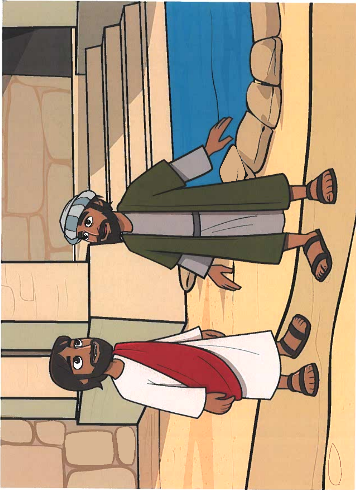
Jesus healed the man born blind.