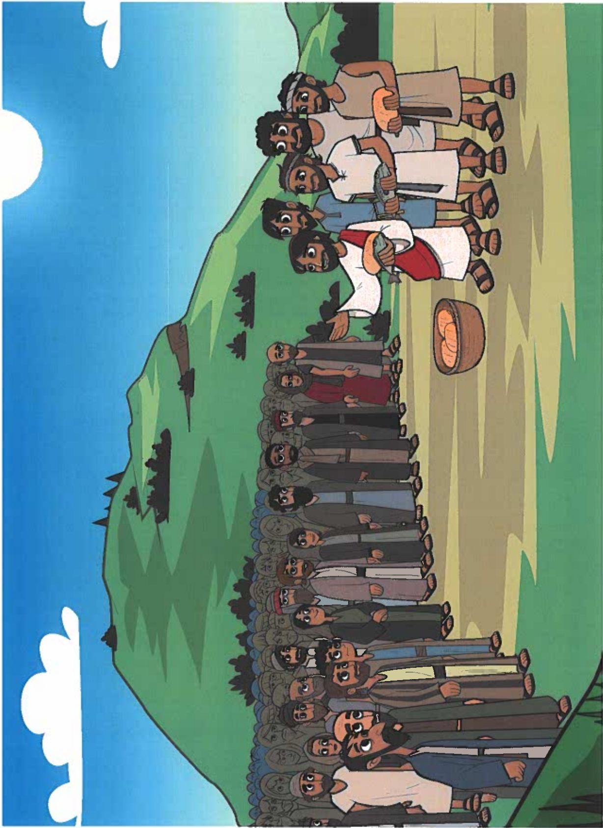
Jesus fed 5,000 people with two fish and five loaves of bread.